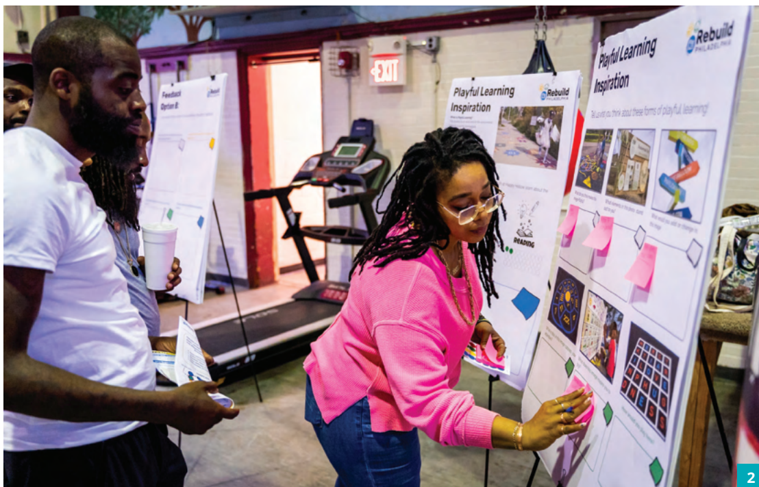
2 Residents provide feedback on Happy Hollow Playground design options during a May 7, 2024 community meeting in Philadelphia’s Germantown neighborhood.

Kenney introduced Rebuild as a $600 million, eight-year capital investment program to revitalize the city’s “460 parks, playgrounds, recreation centers, libraries, and other assets” using $350 million in public funding and $250 million contributed through philanthropy. Kenney described the city’s goal with Rebuild to make civic infrastructure facilities “true neighborhood centers” through restoration and redevelopment (Kenney, 2016). Rebuild would prioritize “the most neglected neighborhoods,” according to former Rebuild Executive Director Kira Strong (2020-2024), with labor hired locally and “[looking] like the folks who use those centers,” per Tumar Alexander, the city’s former managing director (2020-2023). 19 In an interview, Ray Smeriglio (2021-2023), Rebuild’s former chief of staff, described the initiative as a gamechanger, explaining that in “a city like Philadelphia, [the] poorest big city in America, [that] struggles to deliver simple services on a regular basis, you do not have an opportunity to promise and deliver in large scale often. And Rebuild represents the first time in a long time that [city government pledged to] the millions of residents that live here, we are going to invest the right way and en masse in Philadelphia.” 20